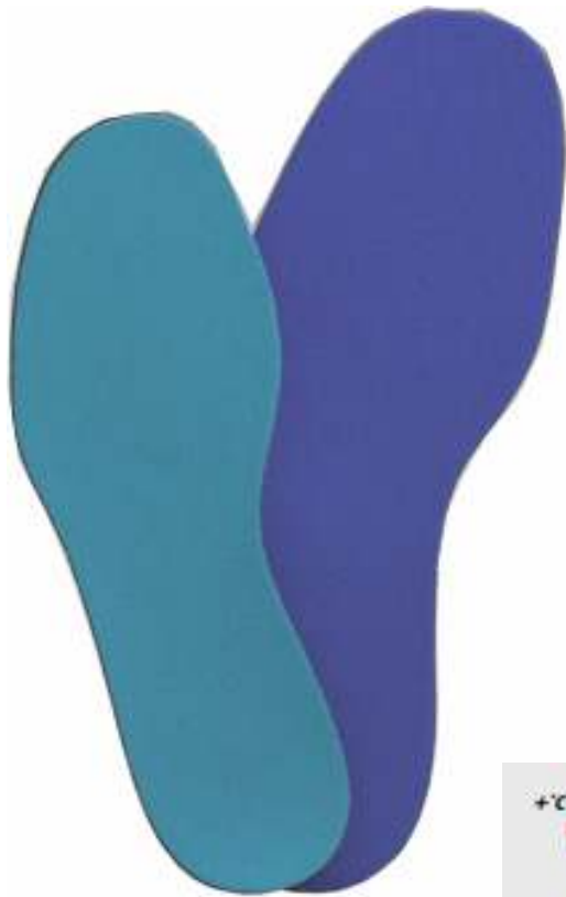
ARCTIC BLUE, Art. 114