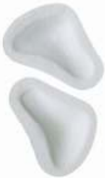
T-Form Art. 135