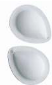
Drop Art. 134

The Modern Foot... Rather than spending our time on soft ground, we too often find ourselves on hard floors and/or in high heels. The result: the longitudinal arch flattens, leading to so-called “splay feet”, which are extremely painful. Bunions may even form. Symptoms of this kind of change in the foot are hard skin at the front of the sole, a burning sensation at the forefoot, sensitivity to pressure, cramps and pain in the arch.