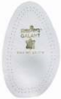
Galant Art 144